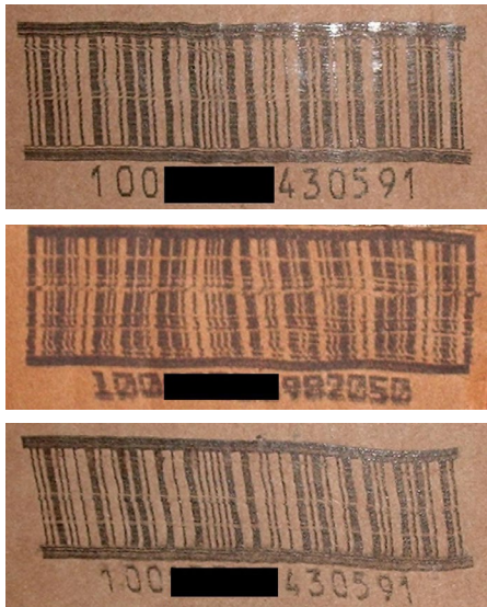
Note the wavy horizontal and vertical lines produced by an inkjet printer. Possible causes include use of roller conveyor, printheads not aligned parallel to carton surface and insufficient material handling.

Whether inkjet printing or using thermal print & apply, material handling is important for successful operation. Inkjet printing barcodes, however, requires a much greater material handling effort with greater precision, less room for out of tolerance operation and, likely, higher costs. Inkjet printing is entirely non-contact, so ink drops must fly through the air to reach the carton. If the carton is bouncing, such as on a roller conveyor, the resulting barcode will appear wavy as in the following examples.